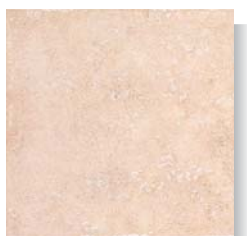
M5 NC ATELIER ROSE PAV. 20x20