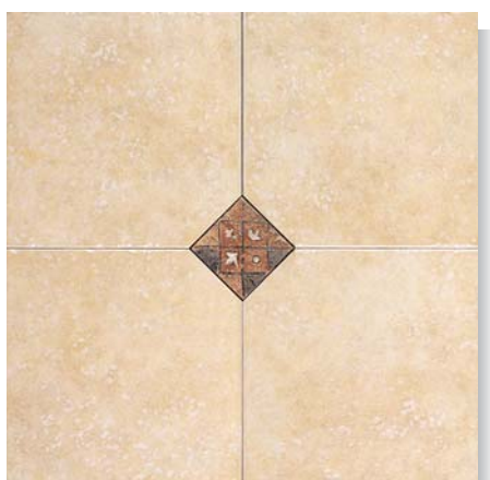
MH CD 40x40