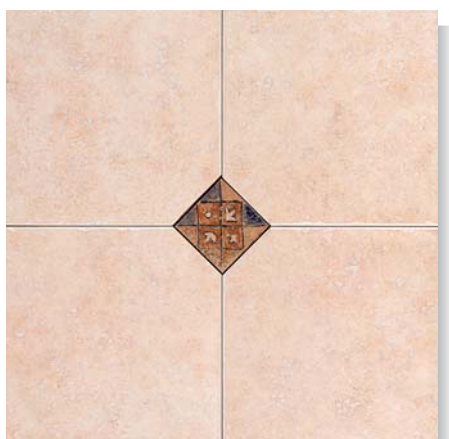
MH CC 40x40