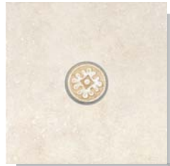
MH CV 20x20