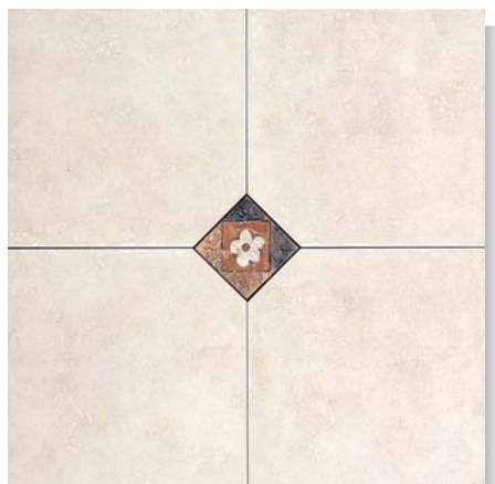
MH CA 40x40