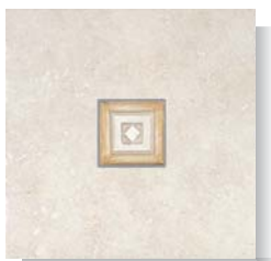
MH A7 20x20 ▼ 83