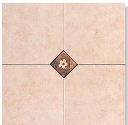
MH CC 40x40