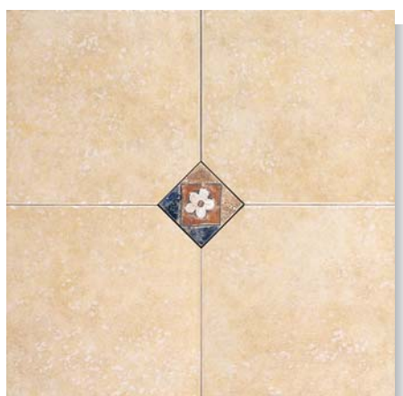
MH CD 40x40