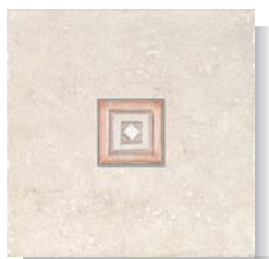
MH A6 20x20 ▼ 83