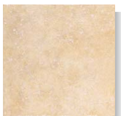
M5 ND ATELIER BEIGE PAV. 20x20