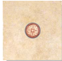
MH CW 20x20