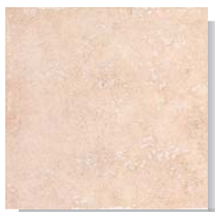
MF RC ATELIER ROSE 20x20