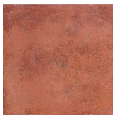
M5 NE ATELIER ROUGE PAV. 20x20