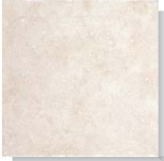
MF RA ATELIER BLANC 20x20

CONFORME - ACCORDING TO - CONFORME - GEMÄß - CONFORME COOTBETCTBYET - ZGODNE - U SKLADU SA - 適應 UNI EN 14411 - L BIII GL