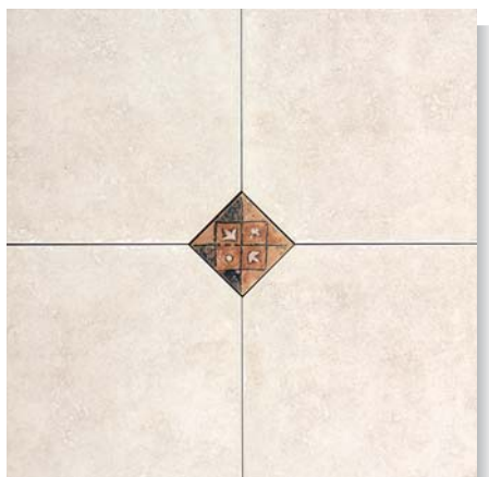
MH CA 40x40