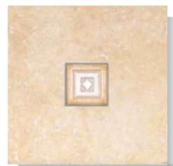
MH A5 20x20 ▼ 83