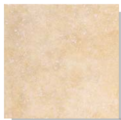
MF RD ATELIER BEIGE 20x20