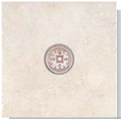
MH CU 20x20