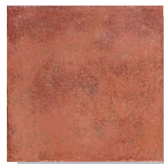
MF RE ATELIER ROUGE 20x20