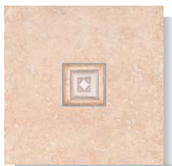
MH A4 20x20 ▼ 83